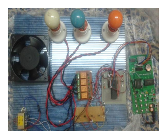
Fig. 2. Implementation of proposed system

With the knowledge of operation of the system was tested step by step to the transistor output and the load was connected across the collector terminal of the transistor.